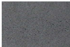
Excelite CFA Density 0.50 g/cc