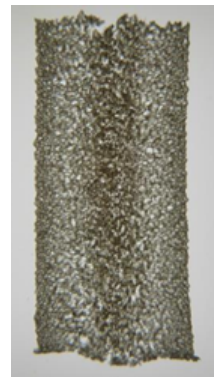
PF-1 Density 0.43 g/cc

To illustrate, in the same PVC dryblend (pictured below), Excelite significantly reduced density with little to no effect on cell quality. The result was lower production density with fewer voids in the extruded sheet or profile, leading to higher quality finished goods and a reduction in scrap rates. This ultimately resulted in improved overall plant productivity with strong density management, control over material consumption and increased extruder productivity. For these processors Excelite was established as the lowest total cost-to-manufacture solution.