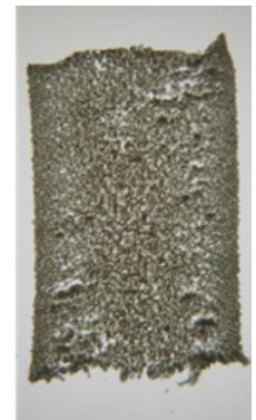
PF-1 Density 0.351 g/cc

Make density and consistency a variable of your process, not just an output. To learn more, contact Avient at +1.844.4AVIENT (844.428.4368).