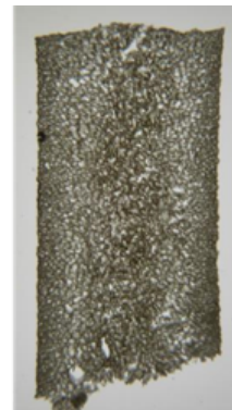
PF-1 Density 0.339 g/cc